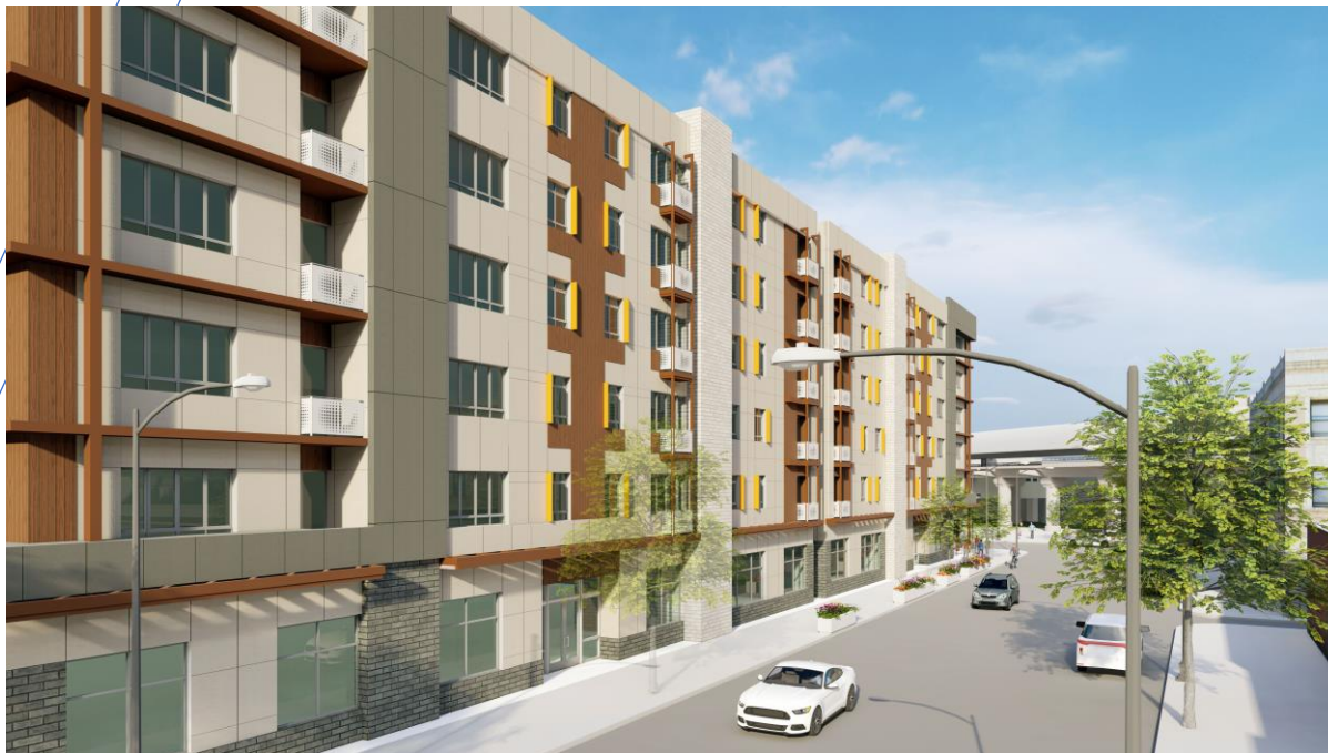
Southwest View – Paulina St