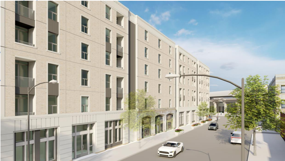
Southwest View – Paulina St