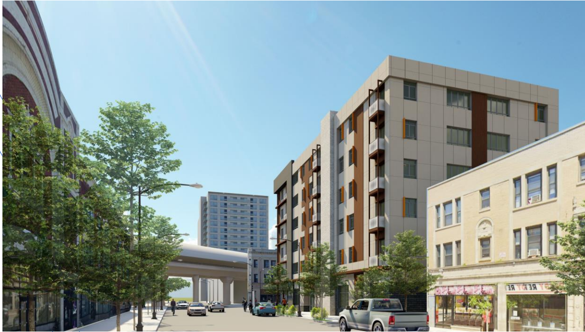
Design A – Phase II East View – Howard St