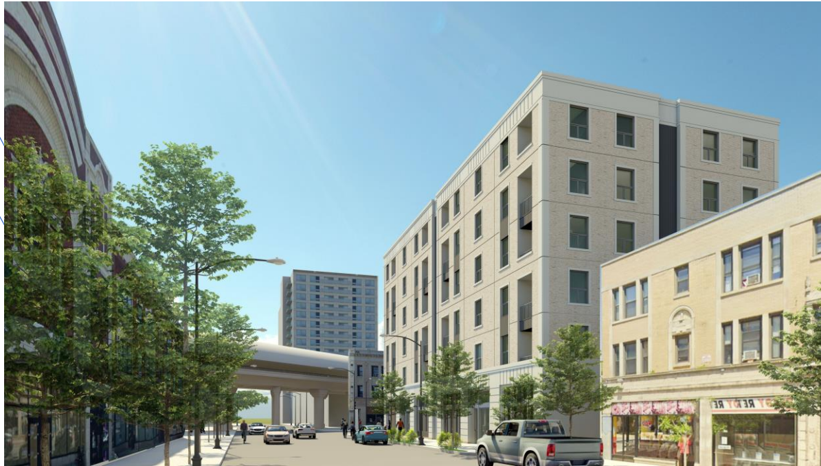
Design B – Phase II East View – Howard St